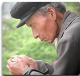
North Korea has been one of the most persecuted countries in the world for decades.

The best way to understand and help the persecuted church is to first become educated about who is being persecuted.