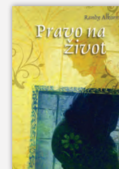
Bosnian Why Pro-Life? book cover

16,079 print subscribers 2,358 online subscribers