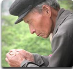
North Korea has been one of the most persecuted countries in the world for decades.

The best way to understand and help the persecuted church is to first become educated about who is being persecuted.