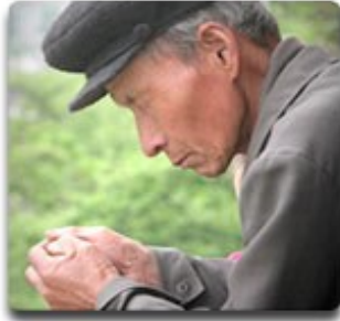
North Korea has been the most persecuted country in the world for decades.

The best way to understand and help the persecuted church is to first become educated about who is being persecuted.