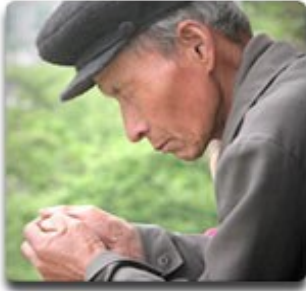
North Korea has been the most persecuted country in the world now for 13 years.

The best way to understand and help the persecuted church is to first become educated about who is being persecuted.